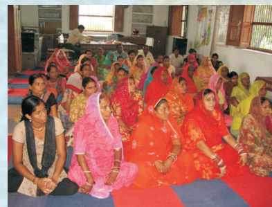
Participants in Mhow, Manpur, Kanpur, Lucknow, Narendrapur, Gaya, Ajmer, Gandhigram, Bakreswar and Udaipur